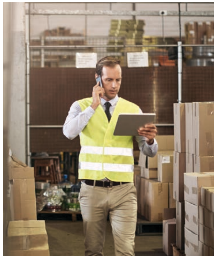
DEADLY DISTRACTION: Using mobile devices in a busy work environment can lead to serious injuries, or worse.